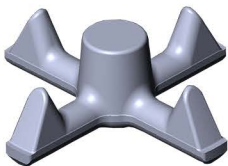
Deck Tie Cruciform